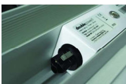
Easy Connecting with Connector.