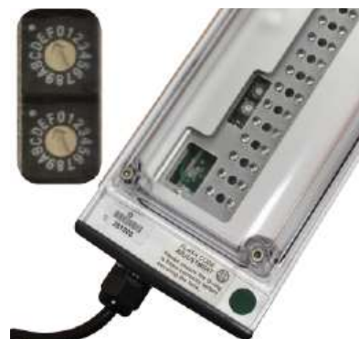
Flash Code Rotary Selecting Switches.